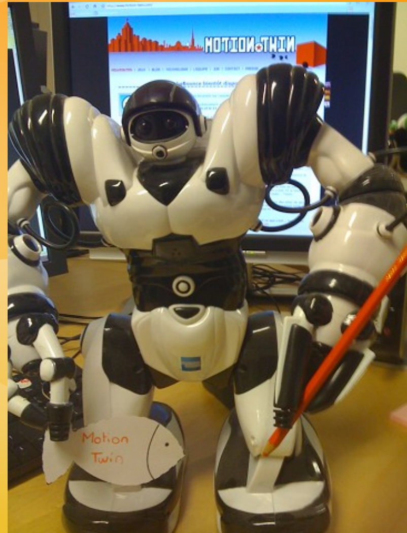
Dalek the robot